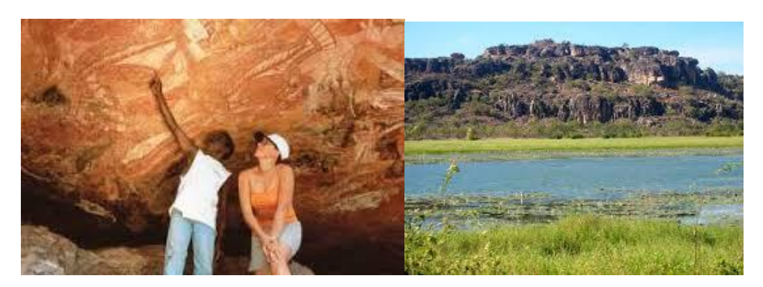
Friday 27 May Day six (Breakfast, lunch, dinner)

This morning we'll depart Maningrida and fly west to the community of Oenpelli.