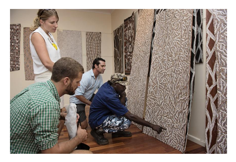
Viewing art at Buku Larrngay gallery, Yirrkala

This afternoon head to the township of Nhulunbuy where will overnight in the local "Walkabout Hotel".